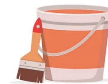
Dyes and Resins